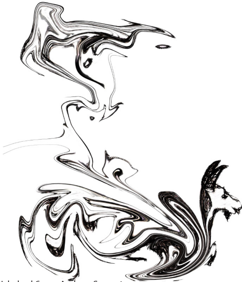
Ichabod Crane Andrew Sorrento

And shall I breathe? But to hear the sound of remembered music and softly smashing far-off rain Drifting to the ground Cold and clear Like the shattered window pane Into an obsidian abyss of pavement Leaving behind a gaping frame Yearning to be filled with something other than hazy visions of the other side of the world. Breathe. The rain has stopped. The glass is merely Wispy splinters And the music is slowing to a barely rhythmic waltz.