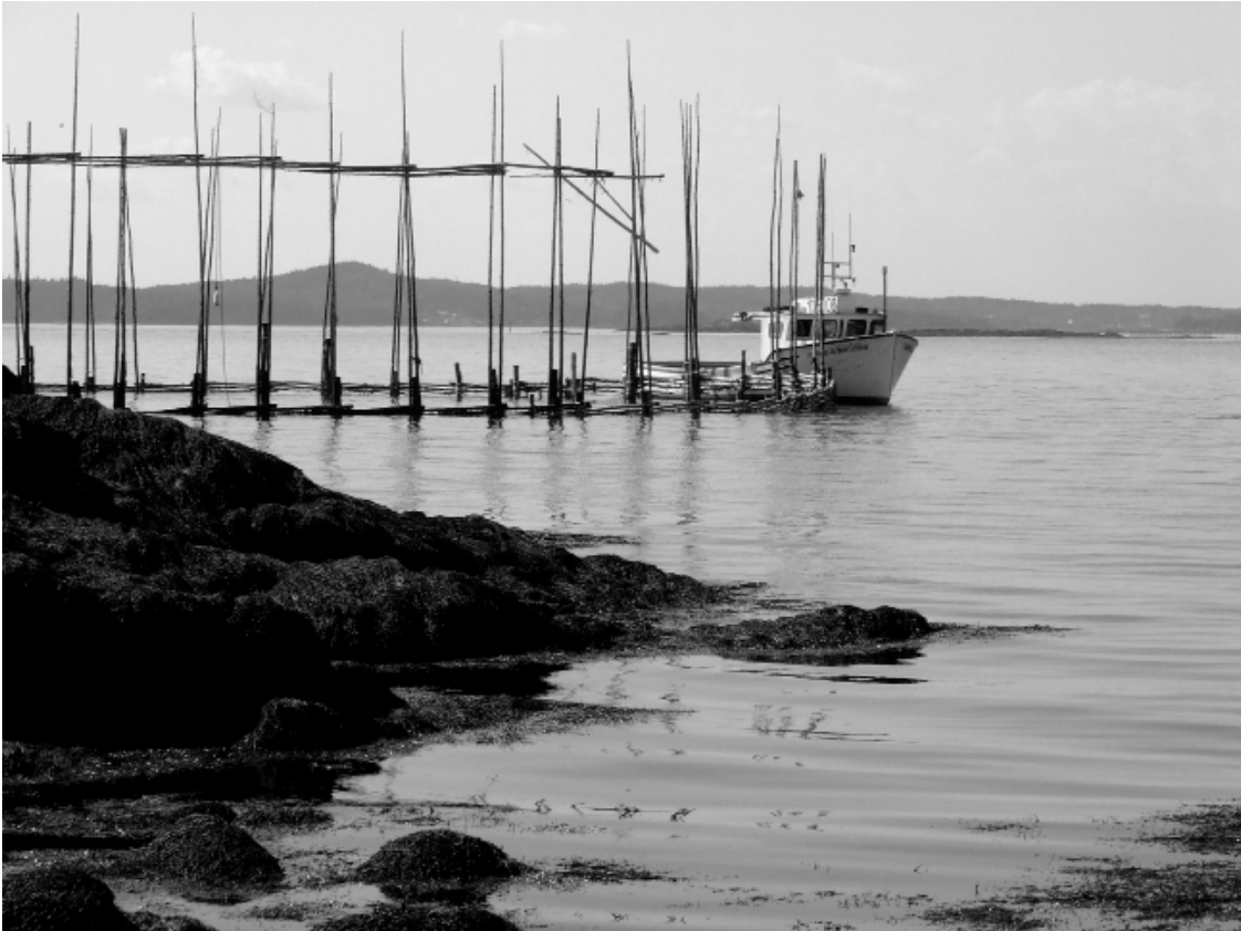
Bay Aileen Connorton

Go ahead. Buy a digital clock for your bedside, And set the alarm for 6 am.